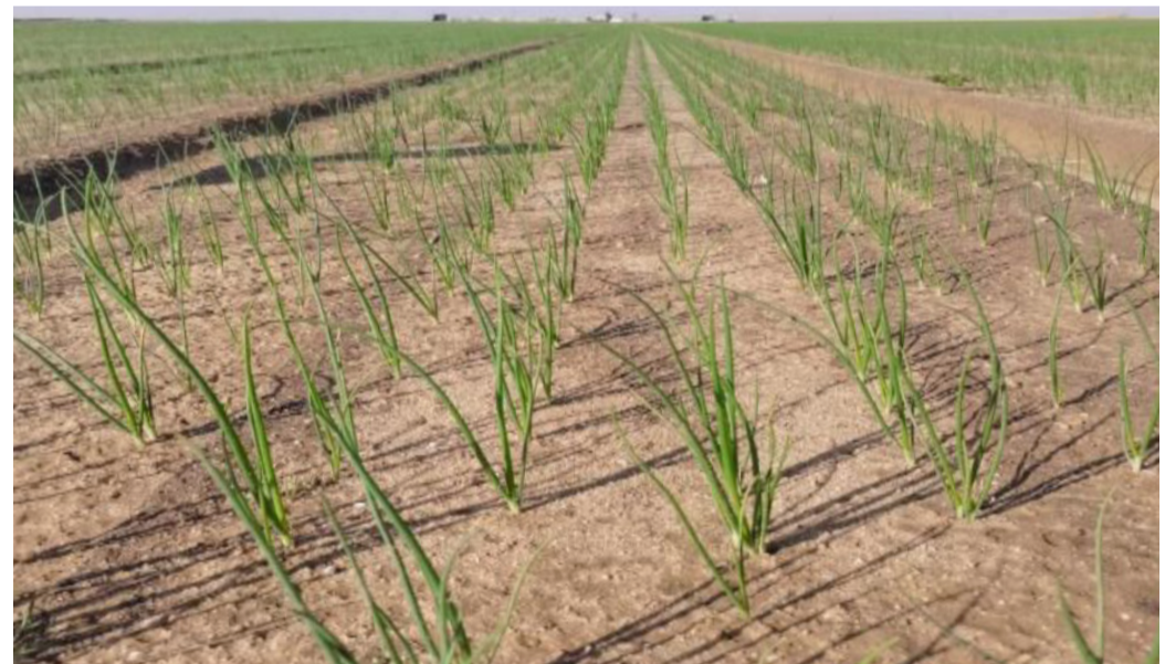
Field in Owaynat growing location

White Onion: CY22 summer white onion acreage is currently expected to be similar to last year. Planting is progressing well and will be completed in November 2021. Harvest will start towards the end of April 22.