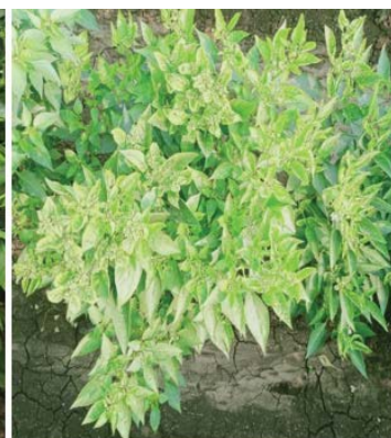
Virus infested plant