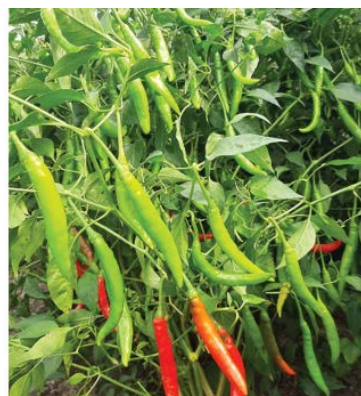
Fruit formation stage